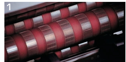
OPTIMAL PERFORMANCE Challenge combination fold rollers deliver crisp, tight folds and provide superior control of slick paper stocks.