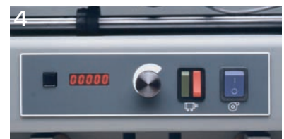
CONVENIENT OPERATION Accessible from either side, the control panel includes a counter and reset button.