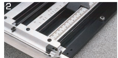
QUICK & EASY SET-UP Flip-up swing deflectors allow set-up changes without fully removing fold plates.