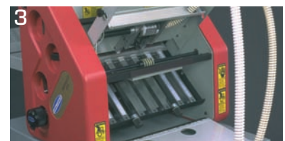
EASY ACCESS A swing-away feed table allows easy access to the lower fold plate.